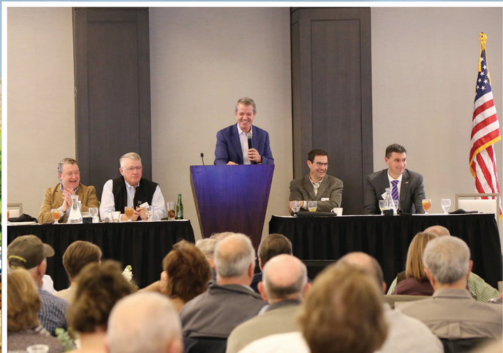
Governor Pillen discussing the importance of access to E15 and the future of biofuels.